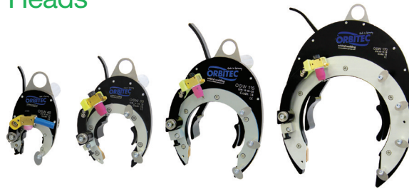
Four weld heads cover the range from 8 mm to 168.3 mm OD

The open-frame weld head is located on one side of the joint. During welding, a gas- or water-cooled torch and cable assembly rotates around the tube or pipe.