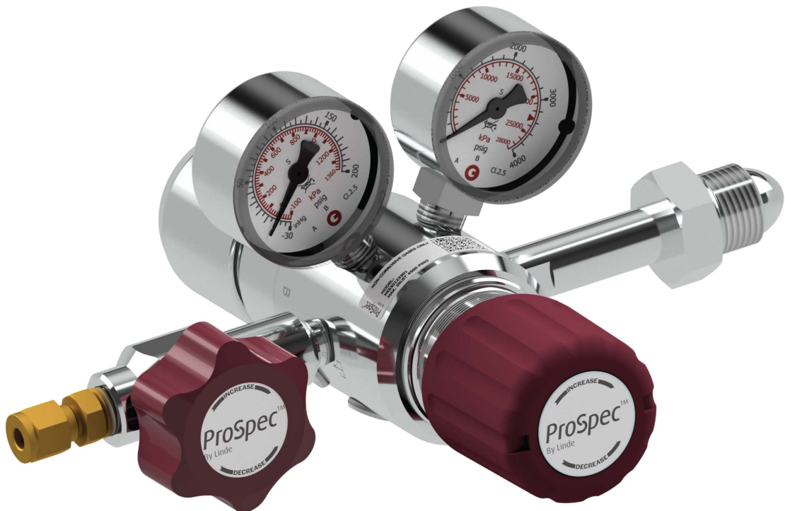
Figure 2-1: Linde® ProSpec™ Regulator PRS3012-3331-580 shown

The Linde® ProSpec™ Regulator (Figure 2-1) is used for high-pressure gas cylinder applications.