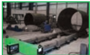
Modular construction allows for multiple lengths to be added for longer vessels.