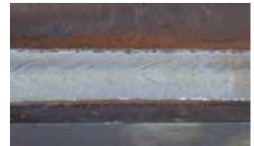
STARGON™ VS gas blend