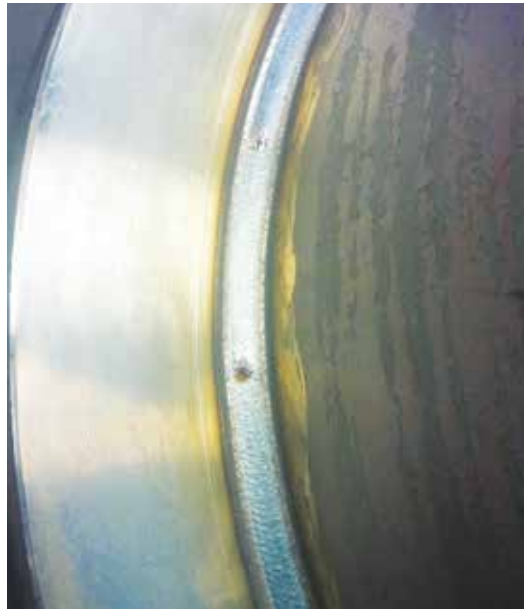
Welded with STARGON™ VS welding blend and .045" 70S-6 welding wire – deposition rate of 17 lbs/hr