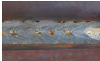
C-10 gas blend