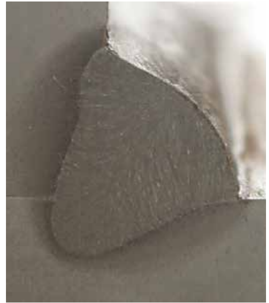
STARGON VS welding blend provides excellent penetration at maximum deposition rates with little or no weld spatter