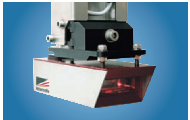
Fiber optic safety management