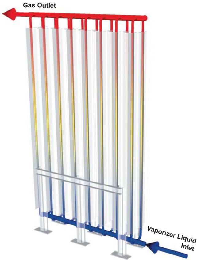
Flow Path, Vertical Configuration