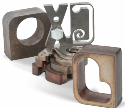
Superior cut quality on mild steel and stainless steel

Extensive testing, backed by more than five decades of experience, guarantees the Hypertherm Associates quality you can count on.